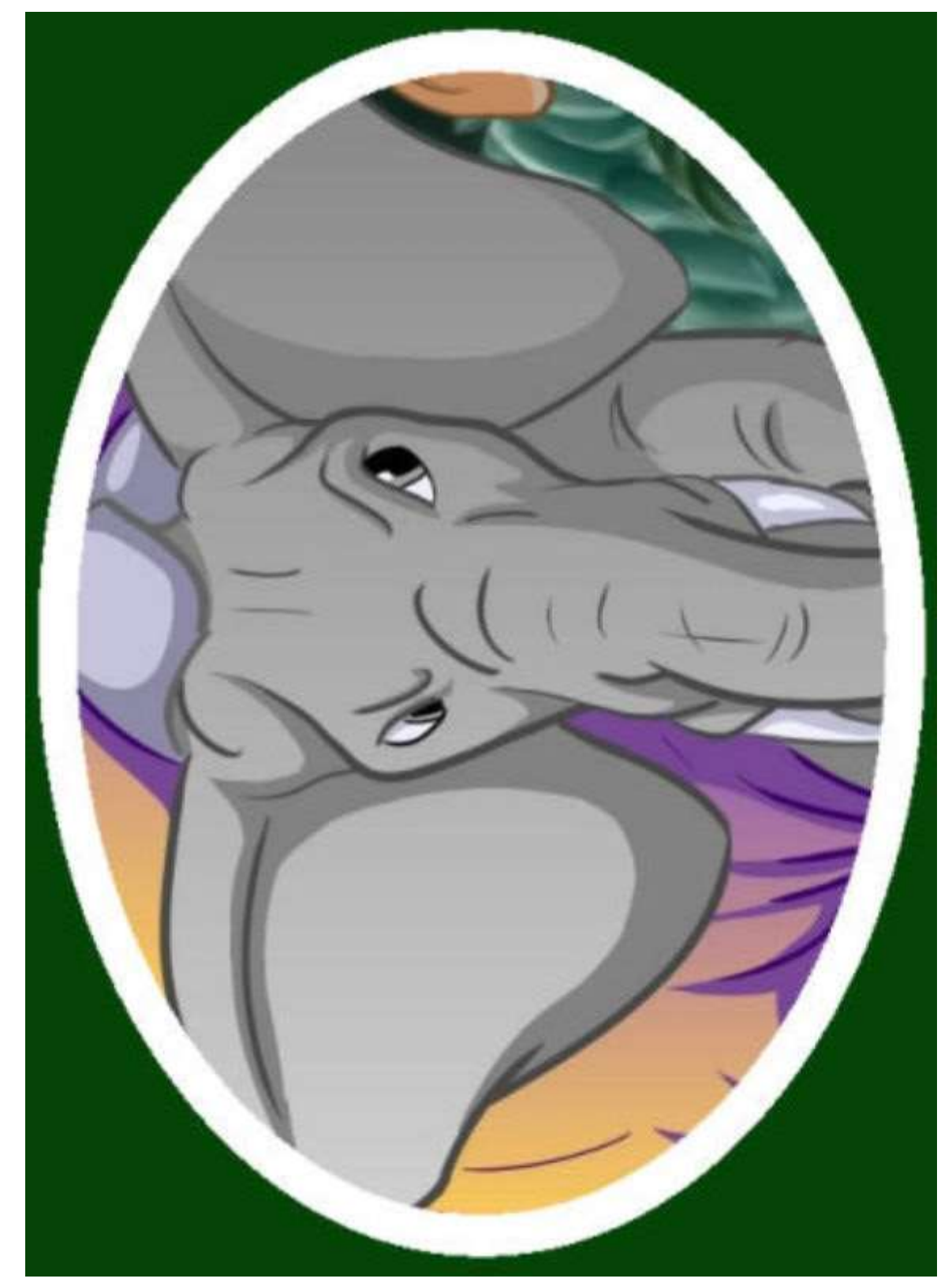
© Kids Sunday School Place, Inc. All Rights Reserved.

Written by Len Schuler Illustrations by Kit Jaspering