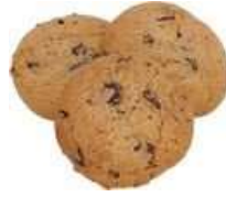
Plate of cookies