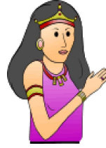
The story of Esther ( Paraphrased )

While growing up a young girl named Esther experienced some very sad and unhappy times. Her people had been forced to move from their homes in Jerusalem and were now held in captivity by King Nebuchadnezzar. To make matters worse, Esther's mother and father had died. ( Esther 2:5-7 )